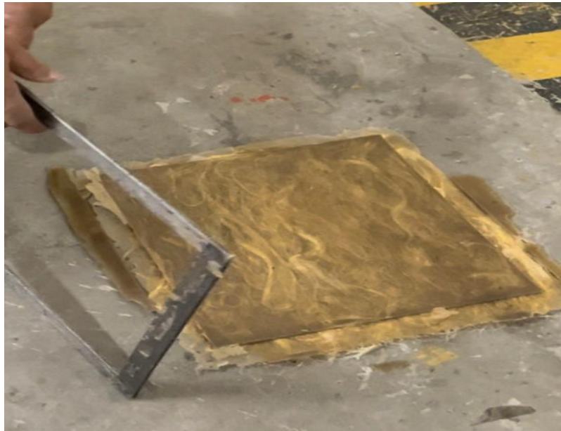
Figure 2. Fabricated Plate